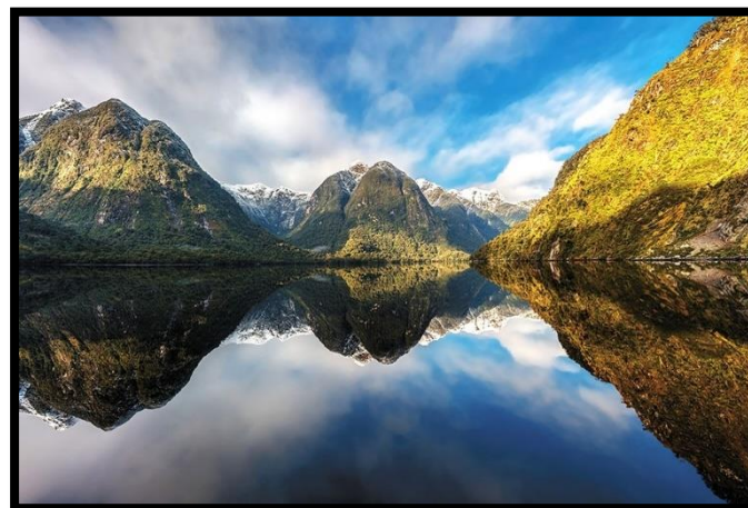
Doubtful Sound – see tour #803 on page 49

Come join us and treat your senses to some of the best culinary experiences around.